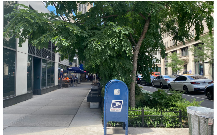
Corner of Vandam Street