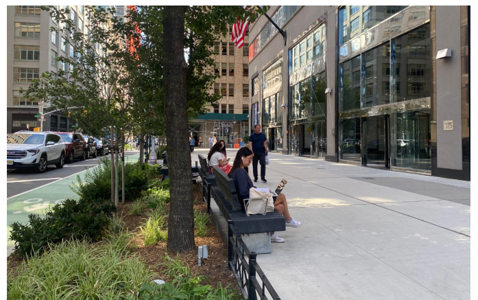
375 Hudson Street