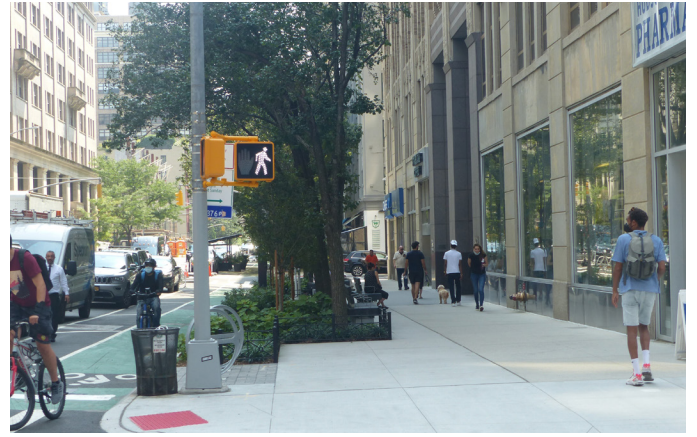
Corner of King Street