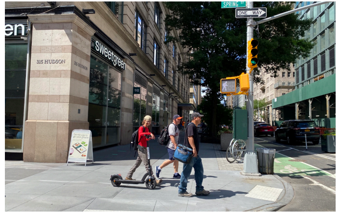
Corner of Spring Street