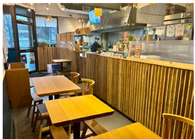
Expanded indoor dining area

“Backing International Small Restaurants” is an International Downtown Association Foundation grant program, supported by American Express, aimed at boosting business for small, independent restaurants that demonstrate a positive impact on their community, and are owned by individuals from underrepresented and/or economically vulnerable groups.