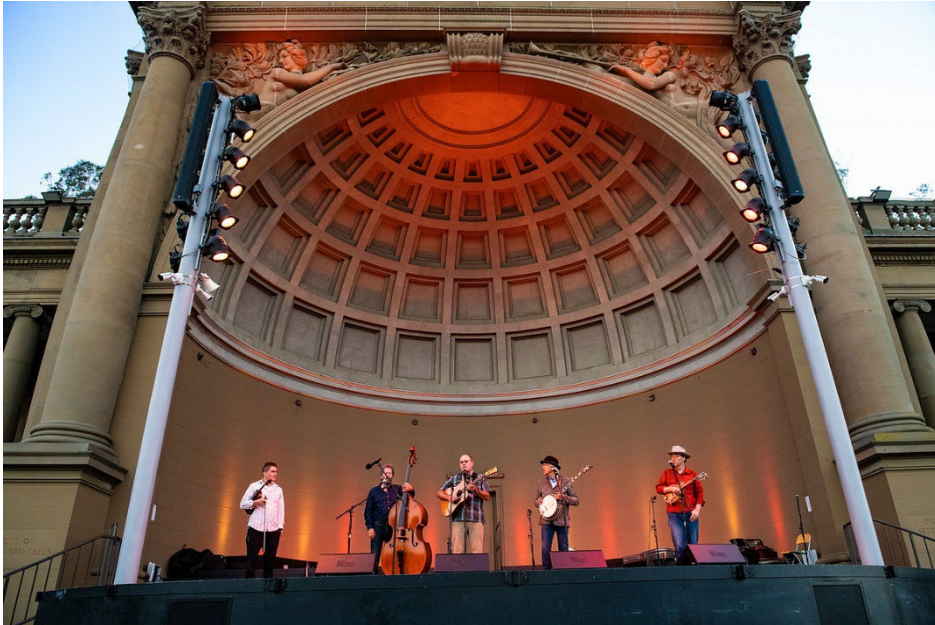
Figure 1 Golden Gate Bandshell reference photo of installation